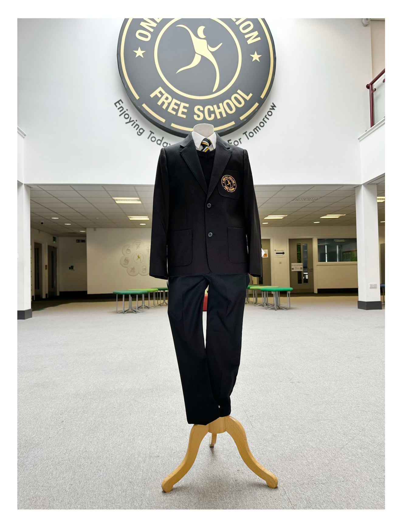
<u>The School Blazer</u> - This must be worn at all times around school and in Assembly. Students may ask their teacher's permission to remove their blazer once in the classroom.

<u>V Neck Jumper (optional)</u> - A black v-neck jumper may be worn in addition to the school blazer.