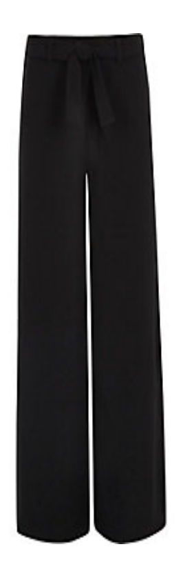
<u>Trousers</u> Tailored black fitted trousers.