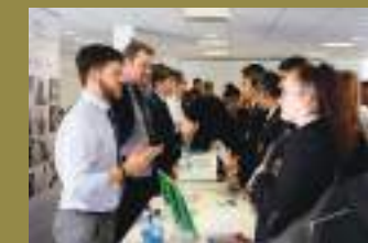
OIAM Careers Expo Broadens Student Horizons