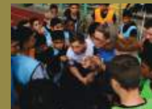
No Matter Which House Group, We Are One Team!