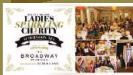
Ladies Sparkling Charity Afternoon Tea Sat 23rd March 2019