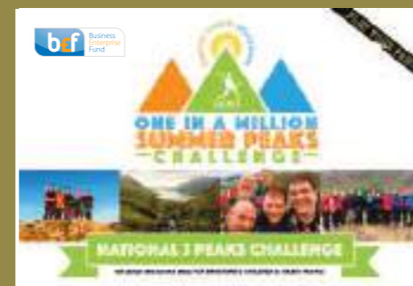
National 3 Peaks Challenge Fri-Sun 13-15th September 2019