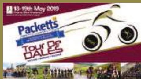
Packetts Tour De Dales Sat/Sun 18-19th May 2019