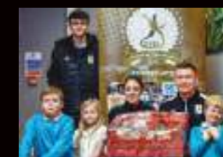
M&S Bradford Donate Hampers To Community Hubs