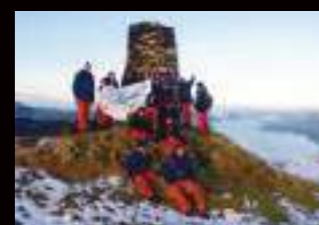
Students Are Pushed To Their Limits!