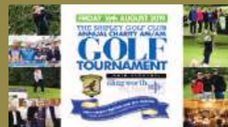
Charity Summer Am/AM Golf Tournament Friday 16th August 2019