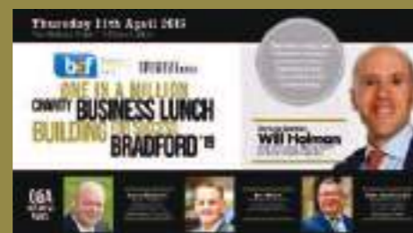
Charity Business Lunch with guest speakers Thurs 11th April 2019