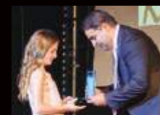
Young People Light Up The Skies At The Stars Awards