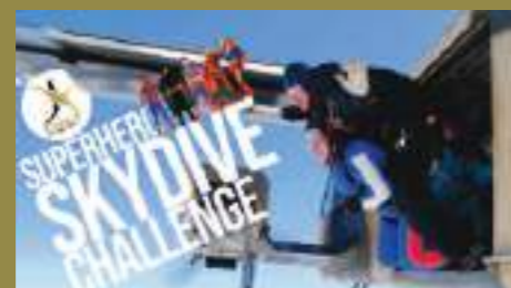
Superhero Skydive Challenge Sat 29th June 2019