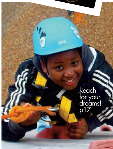
Reach for your dreams! p17