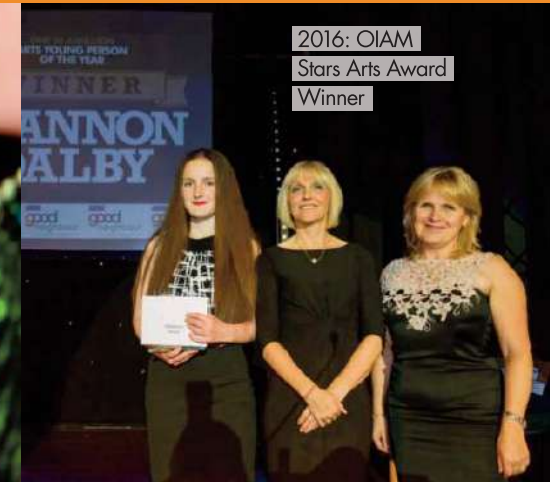
2016: OIAM Stars Arts Award Winner